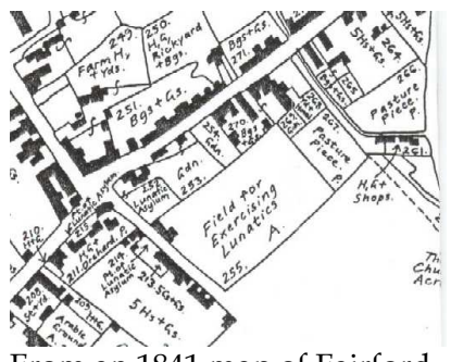
From an 1841 map of Fairford

If you would like to be involved with any of these groups please contact the person concerned or the Secretary.